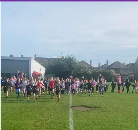
Sponsored Fun Run – September 2023

The children had great fun and we are very grateful to all volunteers for their support and encouragement on the day.